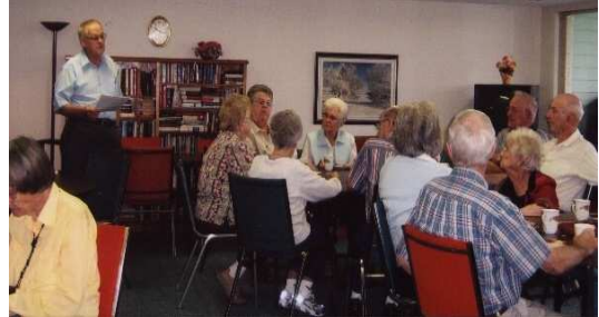
Information given on Co-op Week

It was suggested in the last Newsletter that Co-op week was coming up and encouraged the housing co-ops to be involved during that week to bring awareness to their members and then to submit some information on their event. Response was received from two co-ops.