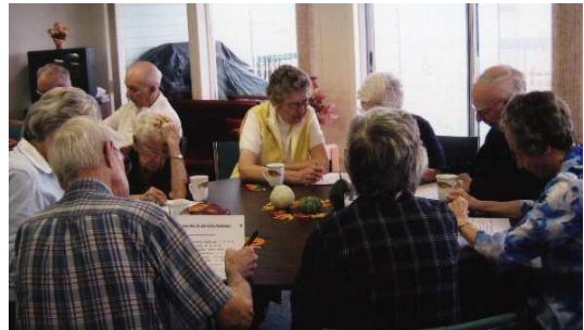
Members doing the quiz

Members from Lakewood Housing Co-op in Regina joined together with members from Argyle Park Housing Co-op to enjoy a delicious supper of 'Beef on a Bun, salad and desert', hosted by the APHC Social Committee. The children had a great time breaking open a couple of pinata's and enjoyed the candy and treats that came spilling out.