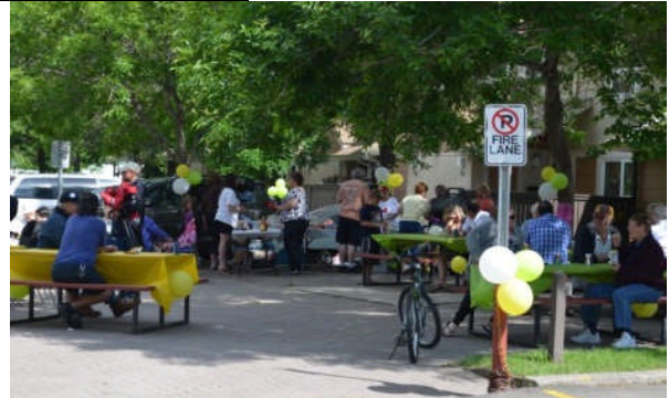
CHAS Event Day in Regina, Saturday, June 25 th